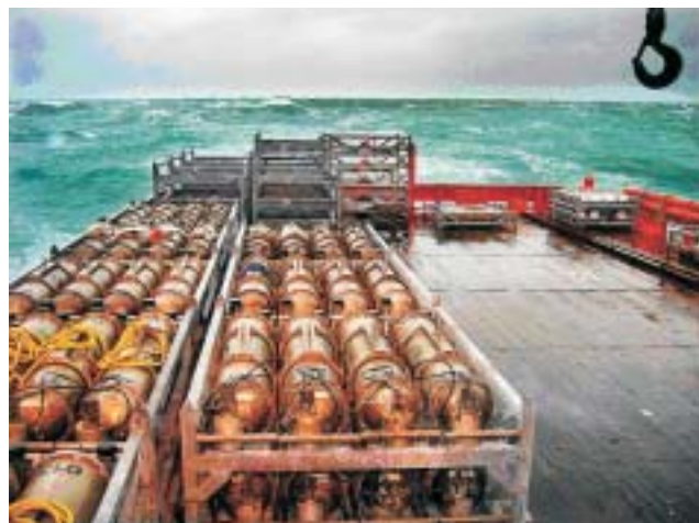
Fig. 3: Picture showing the back deck of DP vessel Normand Tonjer during the 4C- 3D operation at the Cantarell Field.

The second major Node 4C-3D survey was performed by SeaBed Geophysical for Pemex in 2003/2004. This is the world's largest 4C-3D project ever performed (approx. 230 sq.km.). The acquisition was done on the Cantarell field offshore Mexico, which is the world's largest offshore producing field. To be able to cover the requested area, SeaBed utilized 250 CASE Units, which were deployed in 7 patches totalling in approximately 1,400 Node positions. The Cantarell field is densely populated with platforms, subsea structures and pipelines and there is lot of vessel