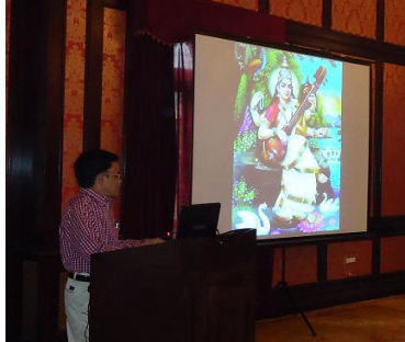
Starting of the Programme with Sarasvati Vandana