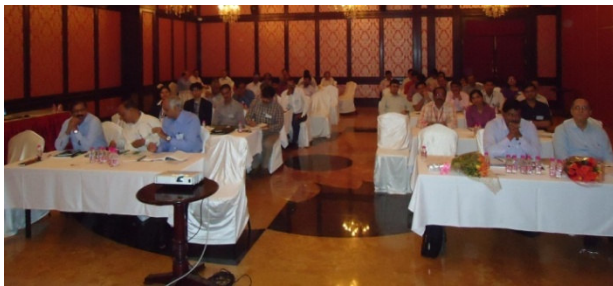
Participants from various Companies from all over India.