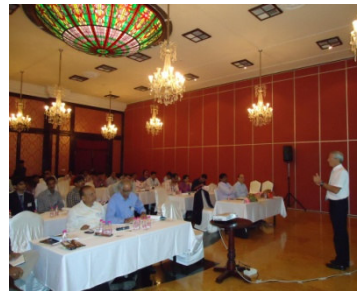
Interactive Questions/Answers Hour