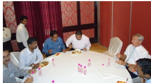
Discussions during Lunch Hour