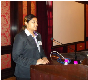
Feed back from a student of MIT, Pune